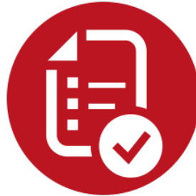
Graduate School application