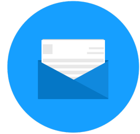
Email additional documents

Do the following 3 things before Thursday, December 1: