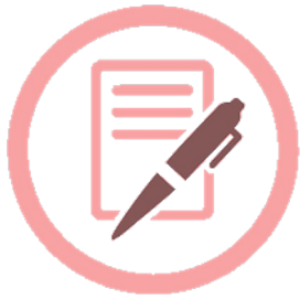
School of Music application